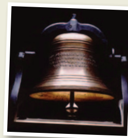
National Mental Health Bell

MHAMD believes that access—to both services and information—is power. In our centennial year, we are proud to continue this tradition by bringing the latest science and the most promising innovation to a meaningful advocacy agenda.